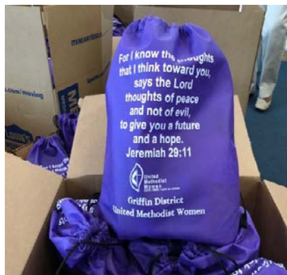
Attendees assembled 150 Pamper Packs which were taken to seven women's shelters in the Griffin District.