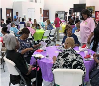
Griffin District United Methodist Women gather for breakfast at Faith, Fun, Everyone.